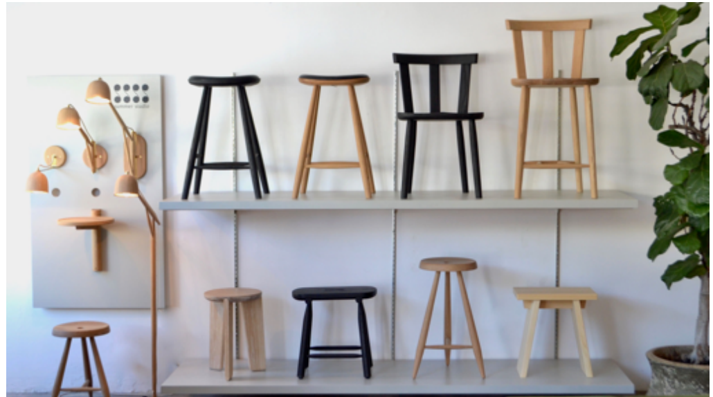
Los Angeles Showroom